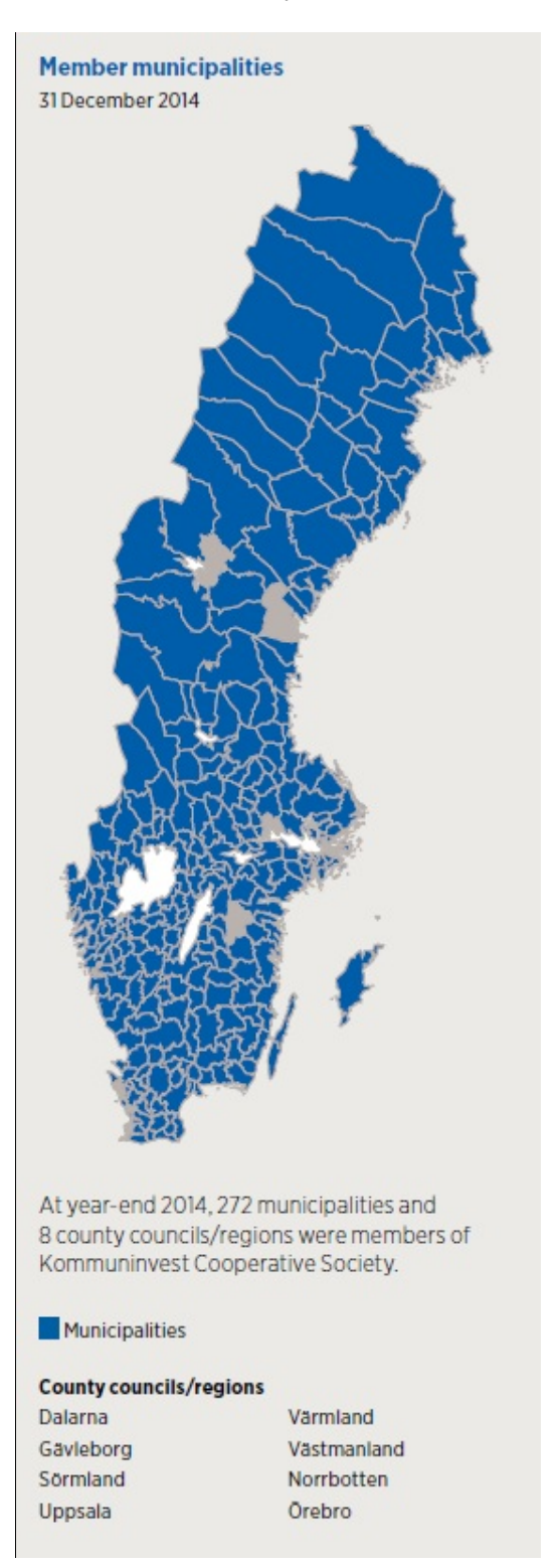
At 31 December 2014, 272 municipalities and 8 county councils were members of the Kommuninvest Cooperative Society

Members of the Society as at 31 December 2014