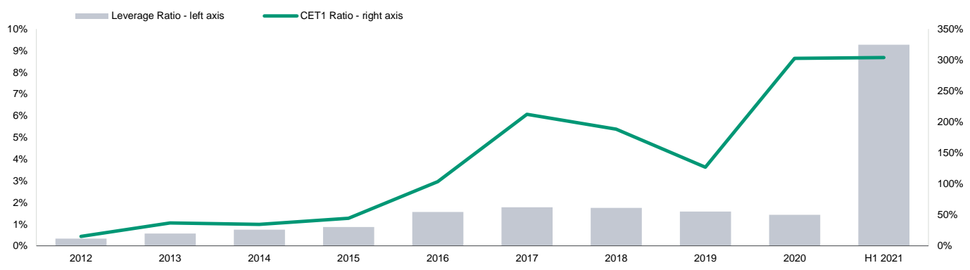
Exhibit 2 Kommuninvest's CET1 and leverage ratios

The increase in leverage ratio in H1 2021 is due to a different ratio definition based on the Capital Adequacy Regulation effective as of 28 June 2021